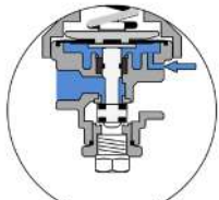
Pressurized Sensor Line / Command