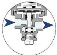
De-pressurized Sensor Line / Command