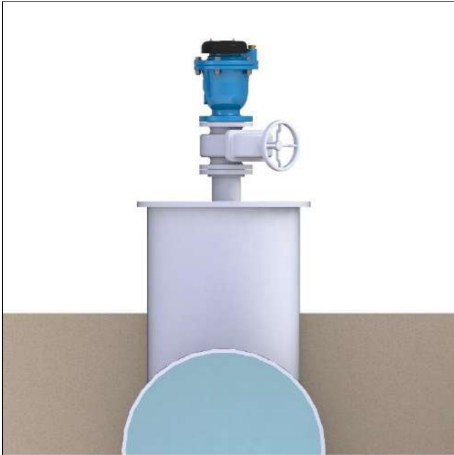
Single Air Valve on an Isolating Valve at 45° to Air Valve outlet