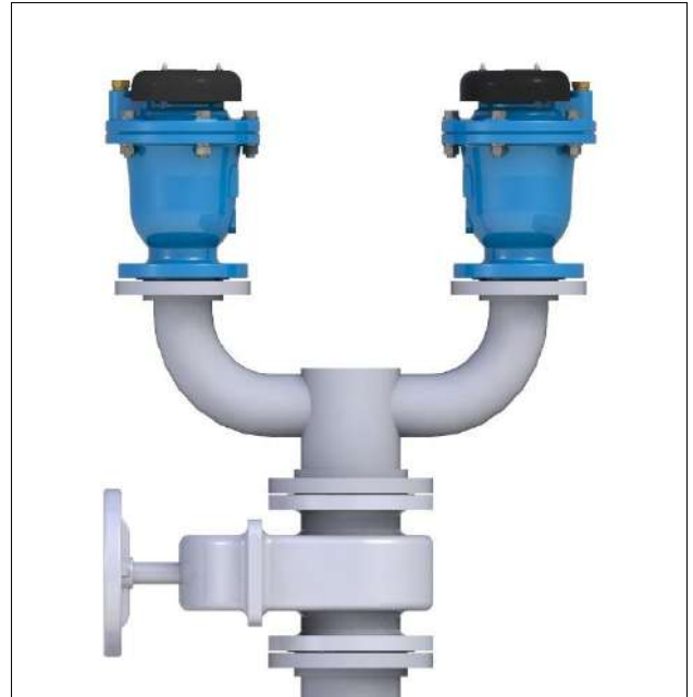
Two Air Valves on a shared Isolating Valve. Air Valves outlets face outward and the Isolating Valve at 45° to Air Valve outlets