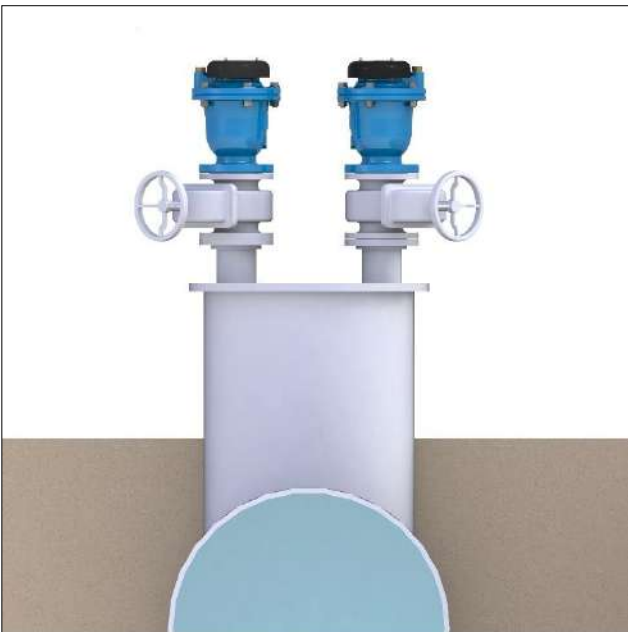
Two Air Valves on an Air Trap with separate Isolating Valves. Air Valve outlets face outward and the Isolating Valves at 45° to Air Valve outlets